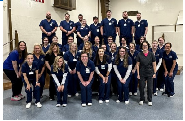
AASN Program Faculty and Students at the Baby We're Back Community Baby Shower