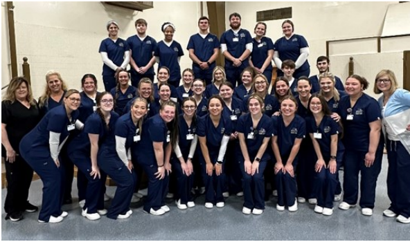
BSN Program Faculty and Students at the Baby We're Back Community Baby Shower